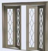
FOLD & SLIDE WINDOWS