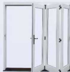
FOLD & SLIDE DOORS