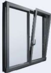
TILT & TURN WINDOWS